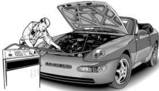
Diagnostic & Repair