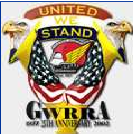
March 2011 Newsletter