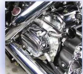
HD Reverse Gear