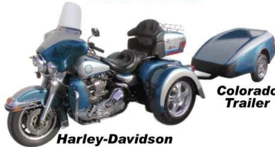
Harley-Davidson Ultra Classic